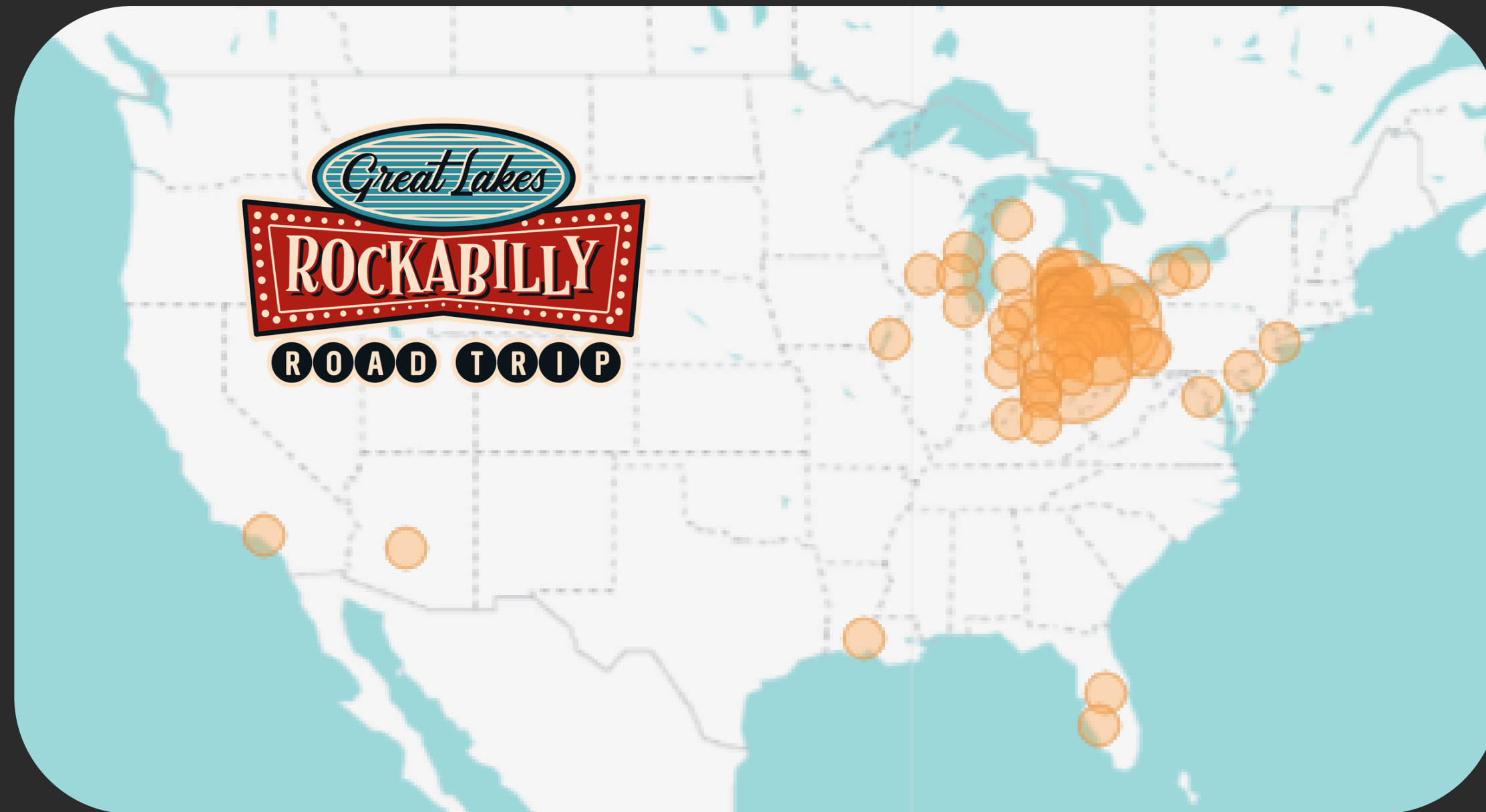
Ticket Purchase locations as of 3/7/26