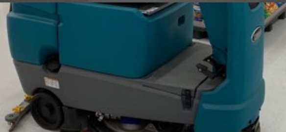
AUTONOMOUS AUTO SCRUBBER