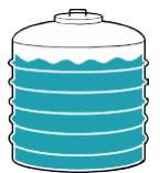
Disinfection Solution Tank (100 L)