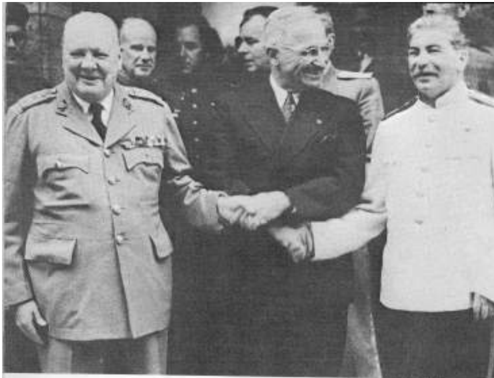
"Big Three" at Potsdam Conference, Churchill of Great Britain (left), Truman of United States (center), Stalin of Soviet Union (right). Then, all three were allies. Today, the Soviet Union is the ENEMY of the United States and Great Britain — in spite of recent talks.