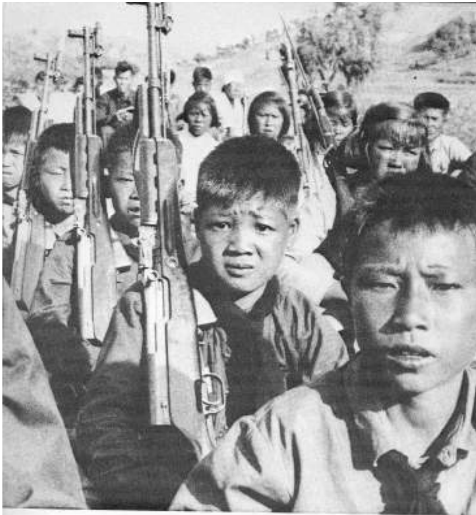
Chinese Children — Taught to Hate United States