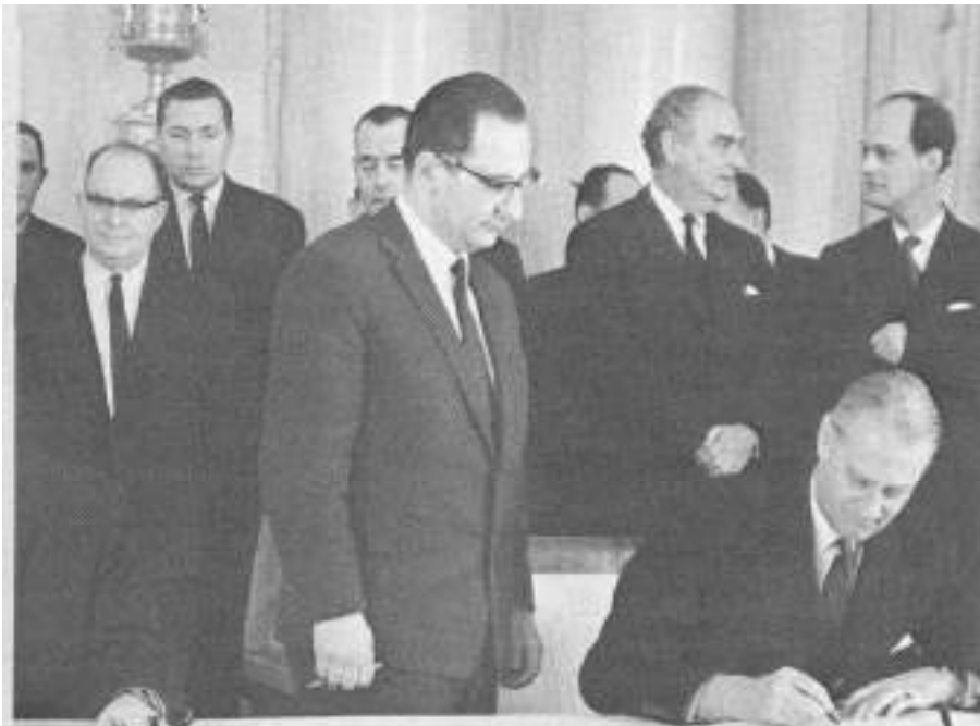
As the U. S. ambassador to Soviet Union, Llewellyn Thompson (extreme left and seated) takes no part in Soviet military establishment.

see how to obey it in PRINCIPLE, and in SPIRIT, not merely according to literal letter.