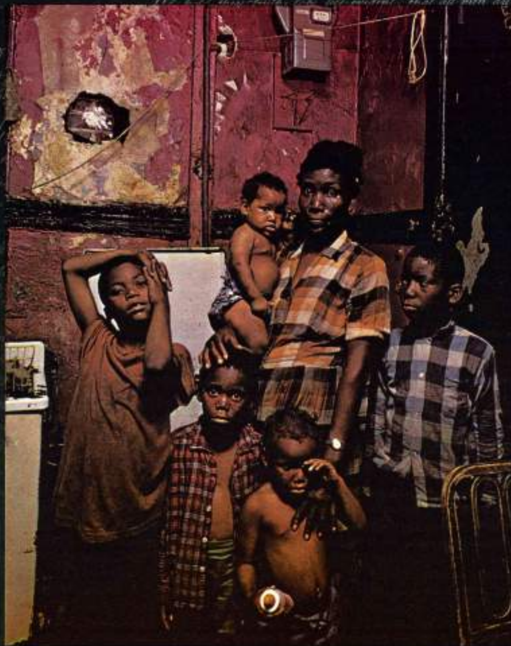
John L. Lewis

Many people in the United States, whether in the ghettos of the big cities, on Indian reservations, in the hollows and back hills of Appalachia, or scattered anywhere throughout the land, do not really enjoy all the privileges of liberty.