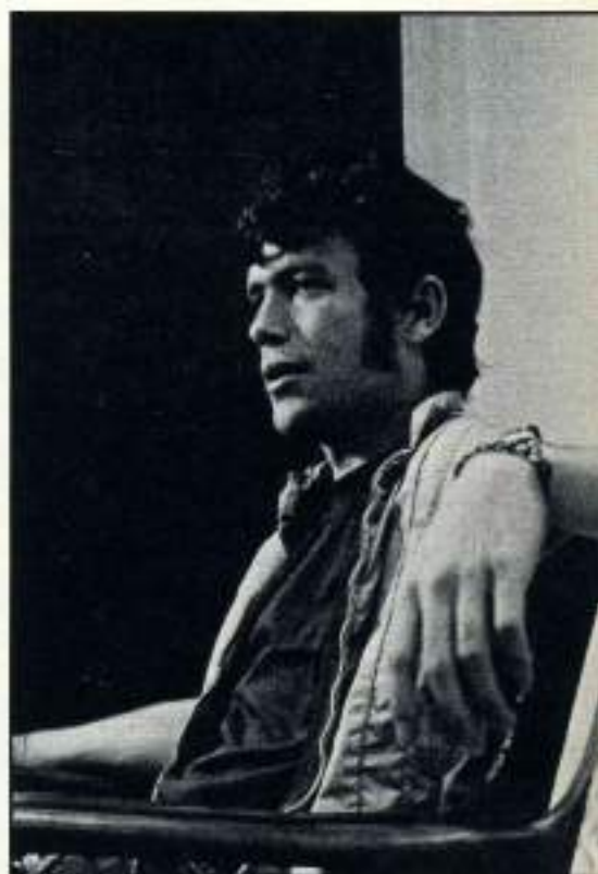
YOUTH counsels with his social case worker about future release and rehabilitation in society.

Irish ghettos have had quite a bit in common with black ghettos — high unemployment, poverty, crime, filth, poor diets. But the black ghettos have lacked one thing that all the others had: a stable home with pride in and recognition of an ancestral cultural heritage.