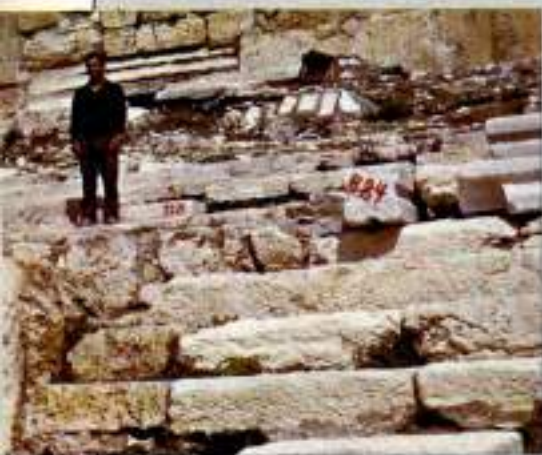
MONUMENTAL flight of Herodian steps leading to the Double Gate.