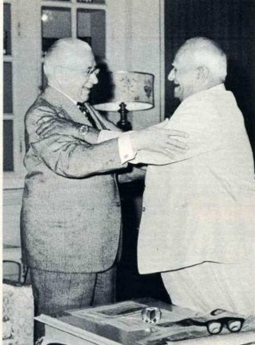
PRESIDENT V. V. GIRI of India extends a warm welcome to Herbert W. Armstrong on Mr. Armstrong's recent trip to Asia.

The garden reaches its most beautiful state in mid-May. Here is breath-taking beauty to be enjoyed — to give delightful pleasure through the sense of sight. Whether