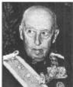
RARE candid snapshot of Spain's ailing General Francisco Franco.

Spanish labor unions are now completely controlled by workers' commissions. Recent union elections produced sweeping victories for left-wing elements, a stunning defeat for Spain's labor establishment.