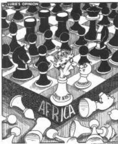
"PLAN WHAT STRATEGY?"

One finds "Christian" morality in the strangest of places. But as for all too many in America, "they boast that their sin is equal to the sin of Sodom; they are not even ashamed. What a catastrophe! They have doctored themselves" (Isaiah 3:9, The Living Bible ).