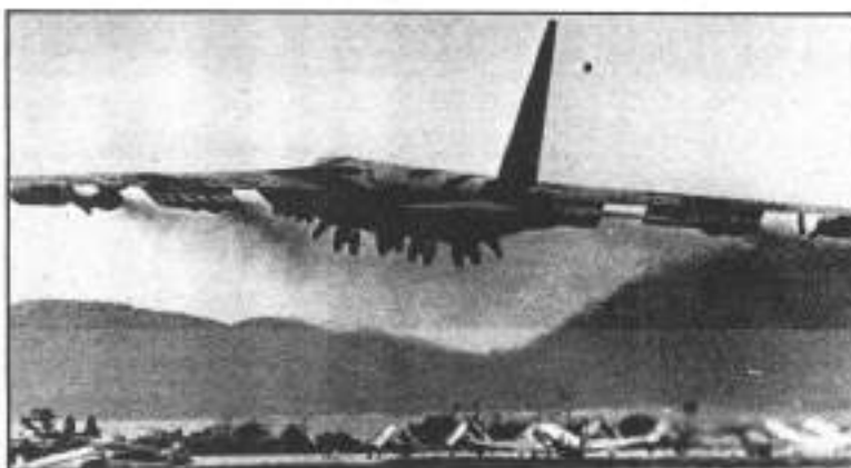
AMERICAN B-52 bomber leaves Thailand for home as part of U.S. troop withdrawal.