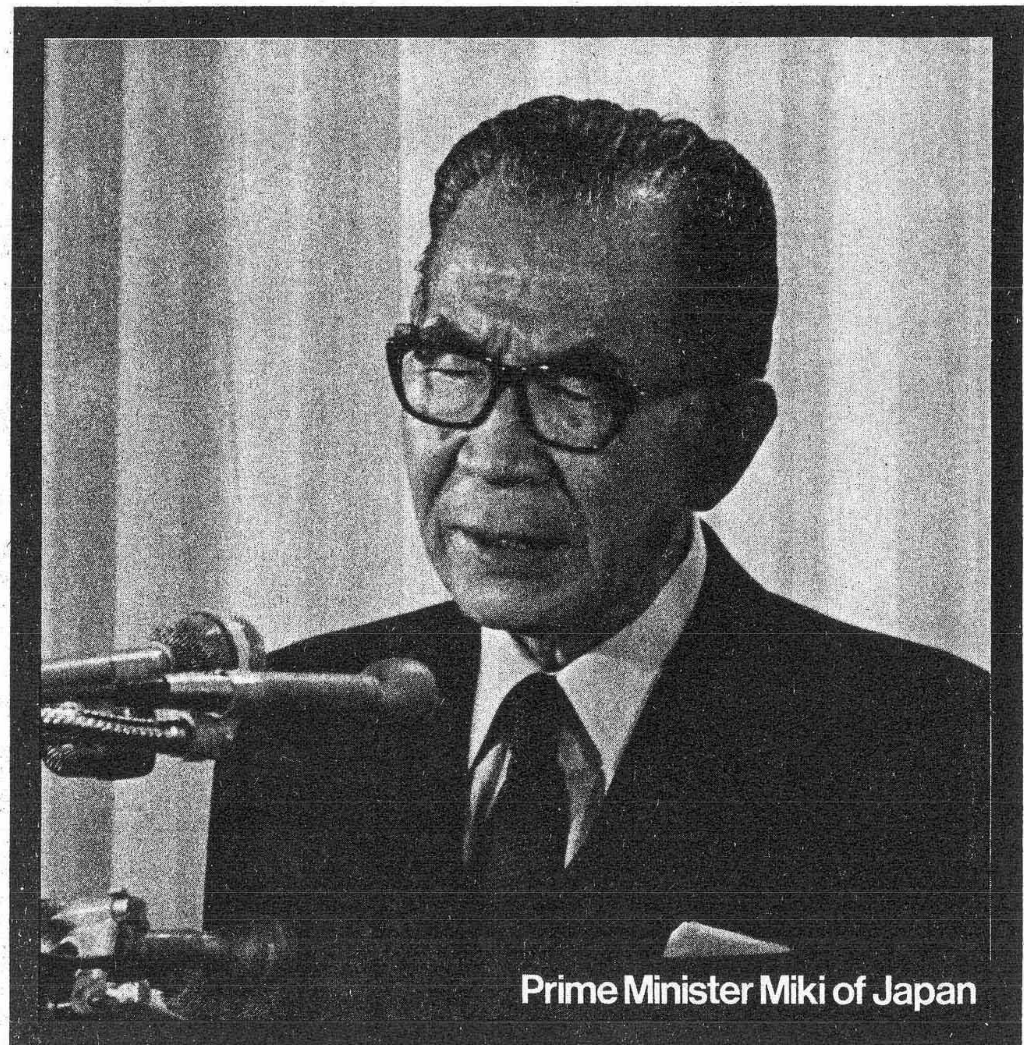
Prime Minister Miki of Japan