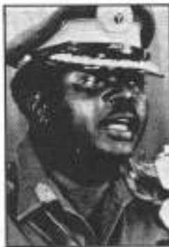
BRIGADIER GENERAL Mohammed addresses Nigerians following coup.

The incoming "soldier-rulers" have generally justified their takeovers on grounds of corruption, political repression or eco-