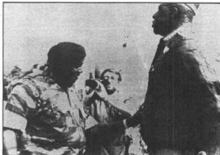
PRESIDENT IDI AMIN of Uganda admires recently unveiled statue of himself in Kampala.

Africa — the Dark Continent — is showing few signs of emerging into the light. Plagued by political instability, poverty, illiteracy, inept and corrupt leaders, economic chaos, civil wars, and tribal rivalries, the nations of Black Africa, for the most part, are seemingly headed for economic and political oblivion.