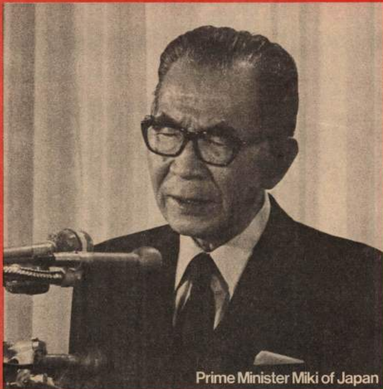
Prime Minister Miki of Japan