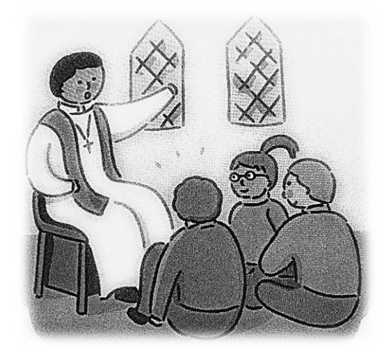
(Illustration adapted from past editions of Sodality Union Manual.)