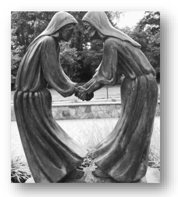
(Photograph of the Visitation, St. John the Baptist, Silver Spring, Maryland.)

(Original source for Preface and Brief History: Past Sodality Union Manuals.)