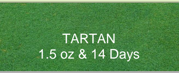
TARTAN 1.5 oz & 14 Days

KEY STRENGTHS: Excellent control of many foliar diseases without any growth regulation concerns and offers a flexible rate range and application schedule from 7 to 28 days.