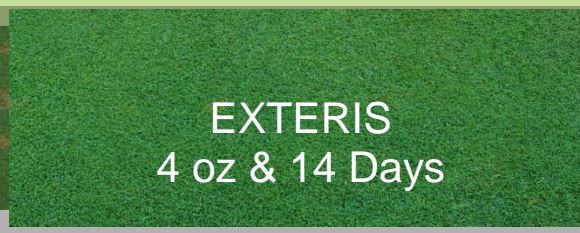
EXTERIS 4 oz & 14 Days

As we move into the summer stress period, don't let Mother Nature catch you with your guard down.