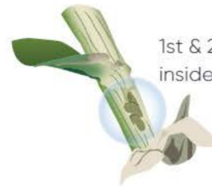
1st & 2nd instar feed inside the plant