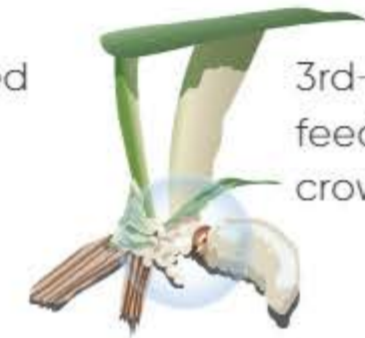
3rd-5th instar feed on the crown of the turf