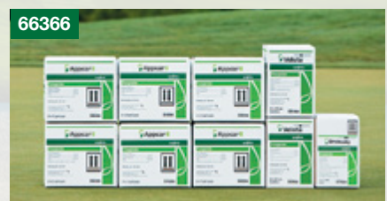
Greens Protection Solution