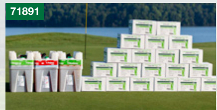
Fairway Starter Solution