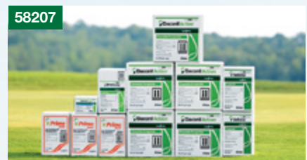
All Season Solution