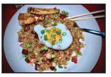
E3. Grand Slam Fried Rice