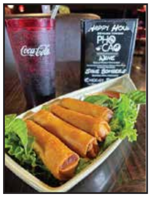
A1. Crispy Rolls

A15. Buddha Spring Rolls (Goi Cuon Chay) $8 -Fresh rice paper rolls with tofu and avocado served with peanut sauce