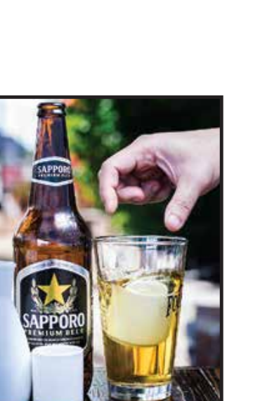
Ask your server about specials from behind the bar!