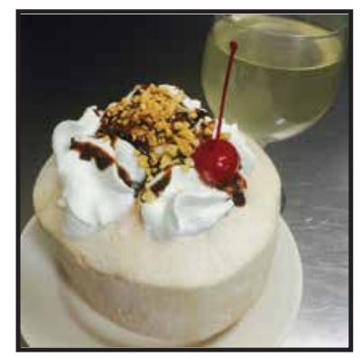
D4. Coconut Ice Cream