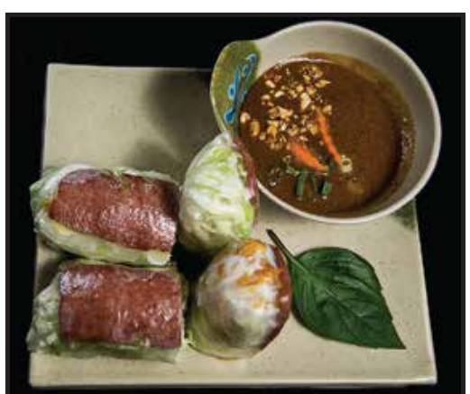
A3. Summer Rolls