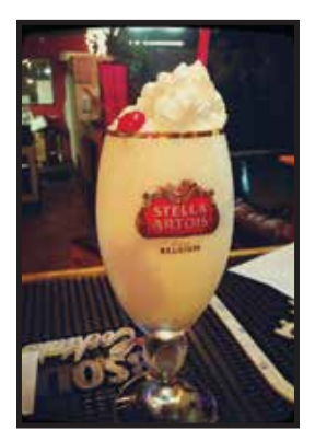
B7. Thai Iced Tea

B9. Soda Chanh $5 -Club soda with fresh squeezed lime juice