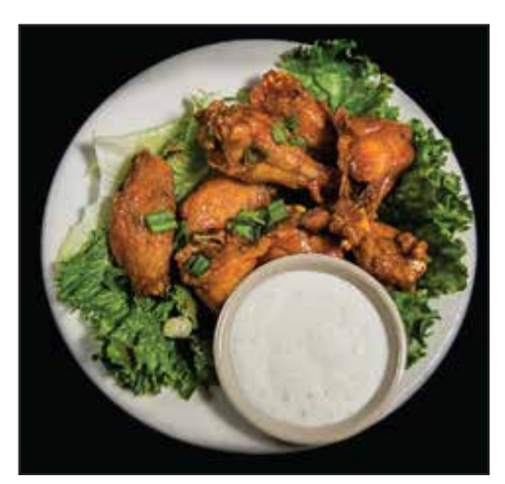
A7. Spicy Chicken Wings