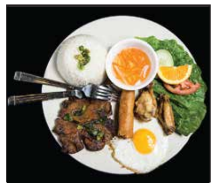
E7. Pork Chop Combo