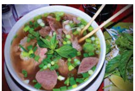
P1. Combo Pho

$14 Reg / $17 Lg Pho with ramen noodles, hard boiled egg, fried spam, and brisket