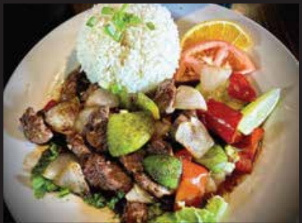
E6. Shaken Beef

-Seafood and vegetable stir fry served atop a bed of crispy noodles