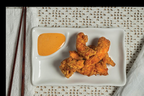
KARAAGE CHICKEN 6 marinated with fresh ginger juice