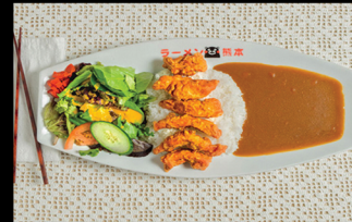
KARAAGE CHICKEN CURRY

Japanese curry platter served with rice and salad with ginger dressing