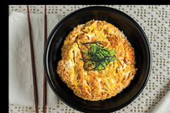
KATSUDON PORK or CHICKEN