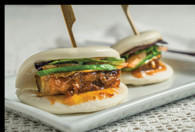
PORK BUN 6.5 soft with spicy mayo