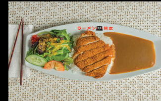
KATSU CURRY PORK or CHICKEN