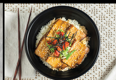
CHARSHU DON (roast pork)