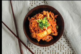
KIMCHEE 5 contains shellfish