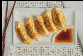
PORK GYOZA 6 pan fried or steamed