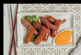
JAPANESE SAUSAGE 5.5