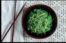
SEAWEED SALAD 5