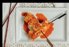
TEMPURA SHUMAI 6.5 with spicy bean sauce