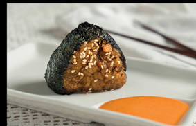
CHARSHU ONIGIRI 3