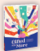
Gifted for More