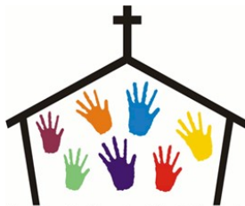
Grace Lutheran Preschool