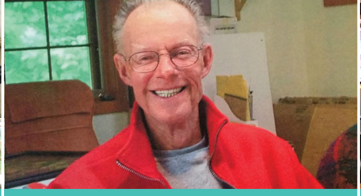
What will your legacy be?