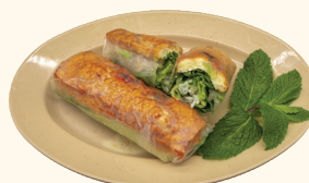
105 GỎI CUỐN CHAY 2 PCS Rice paper wrapped around tofu, noodle, lettuce, and basil $5.90