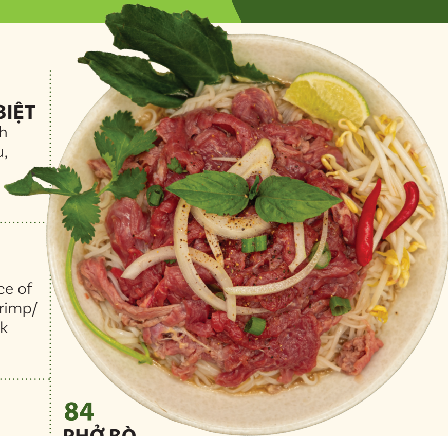
84 PHỞ BÒ FILET MIGNON Beef noodle soup featuring tender slices of filet mignon $17.90