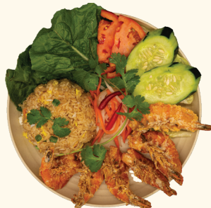
81 CƠM CHIÊN TÔM RANG MUỐI Fried rice with savory-salty seasoning mix fried shrimp $15.90