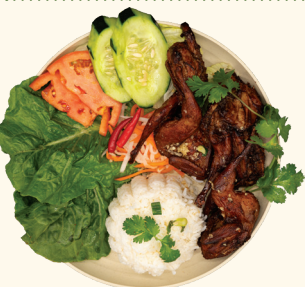
82 CƠM CHIM CÚT CHIÊN BƠ Butter-fried quail with crispy skin and juicy, flavorful meat with rice $18.90