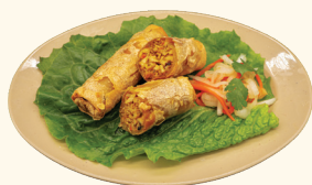
104 CHẢ GIÒ CHAY 2 PCS Vegetarian eggrolls $5.90