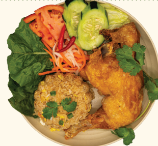
83 CƠM CHIÊN GÀ XỐI MỠ Golden fried chicken with fried rice $14.90