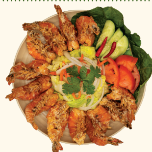
79 TÔM RANG MUỐI Salted and pepper shrimp $19.90