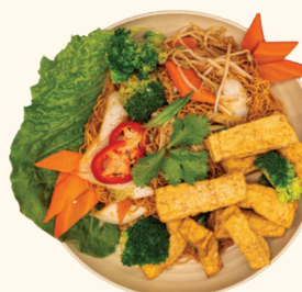
109 MÌ XÀO GIÒN/MỀM Soft OR crispy egg noodle with vegetarian stir-fried, tofu & vegetables $15.90