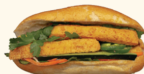
115 BÁNH MÌ CHAY ĐẬU HŨ/ BÌ CHAY Vegetarian tofu OR fried veggie noodle sandwich $6.90