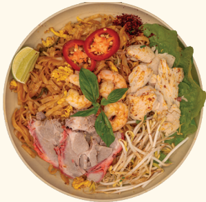
76 PAD THAI Pad Thai with 1 choice of meat: beef/ pork/shrimp/ chicken/roasted pork $15.90