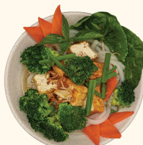
107 BÁNH CANH CHAY Vegetarian udon noodle soup with tofu and vegetables $13.90