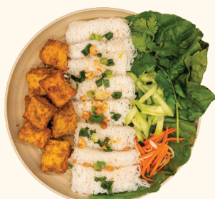
110 BÁNH HỜI CHAY Angel hair noodle with sautéed lemongrass and chili tofu $15.90