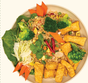
113 CƠM CHIÊN CHAY ĐẬU HŨ (CÓ TRỨNG) Vegetarian fried rice with tofu, egg, peas, and carrots $13.90