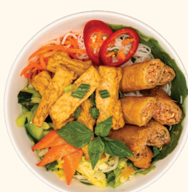
111 BÚN CHAY ĐẬU HŨ VÀ CHẢ GIÒ Vermicelli with tofu and vegetarian eggroll $13.90