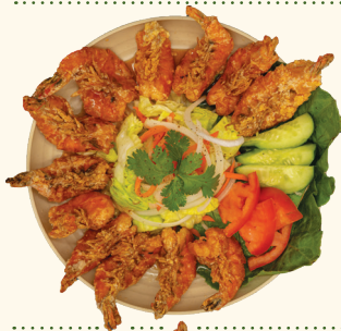
77 TÔM RANG ME Tangy-sweet Vietnamese fried shrimp $20.90