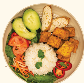
114 CƠM TẤM ĐẬU HŨ XÀO SẢ Vegetarian broken rice with sautéed lemongrass and chili tofu $14.90