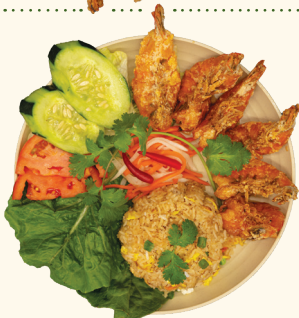
78 CƠM CHIÊN TÔM RANG ME Fried rice with tangy-sweet Vietnamese fried shrimp $16.90