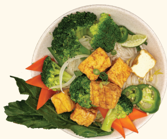
106 PHỞ CHAY ĐẬU HŨ VÀ RAU Vegetarian tofu and vegetable with rice noodle soup $13.90