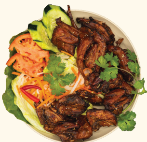
80 CHIM CÚT CHIÊN BƠ Butter-fried quail $ 24.90