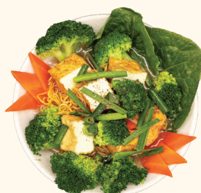
108 MÌ CHAY ĐẬU HŨ VÀ RAU Vegetarian tofu and vegetable with egg noodle soup $13.90