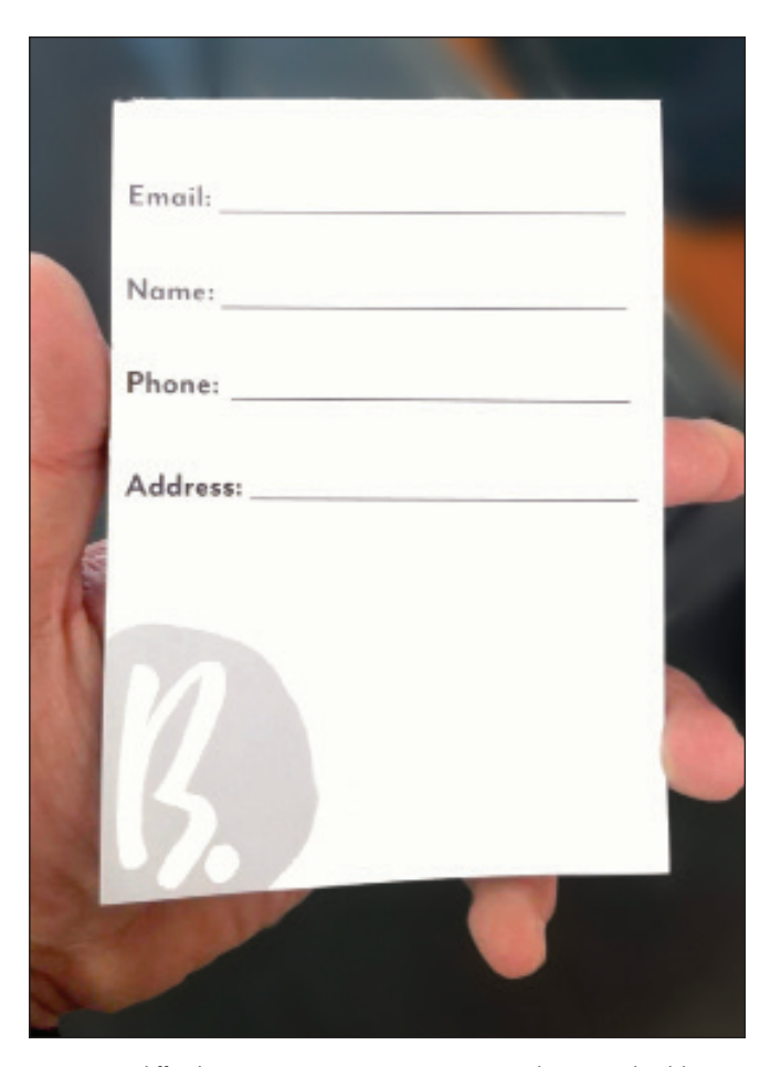
Having difficulty getting customers to give you their email address? Try using contact information forms, like this one from Best Framing in Costa Mesa, CA. This form lists "email" right at the top, even before "name," increasing the likelihood of a response.