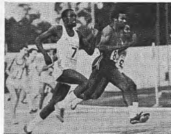
Three of the world's greatest sprinters in action at the Coca-Cola Meeting. Steve Williams (8) on his way to victory in the 200m over Don Quarrie and Steve Riddick (7).

30/31.8. Helsinki. (Finland 109, USSR 103!) 100/200: Rajamaki 10.55/20.86; 400: Kukkoaho 46.63; 800: Ponomarev (U) 1:47.7; 1500/5000: Paivarinta 3:41.2/13:53.2; 10,000: Viren 28:11.4, Tuominen 28:11.8; 3000SC: Kantanen 8:33.0; 110H: Myasnikov (U) 13.89; 400H: Alanen 51.2; 4 x 100: USSR 40.19; 4 x 400: Finland 3:08.8; HJ: Grigorov (U) 2.17/7'14". PV: Issakov (U) 5.20/17'04". LJ: Pereverzev (U) 7.81/25'7"; TJ: Kuukasjarvi 16.87/55'44", Piskulin (U) 16.71/54'10"; SP: Voykin (U) 20.10/65'11", Baryshnikov (U) 20.02/65'84"; DT: Tuokko 64.10/210'4", Kahma 63.18/207'3"; HT: Sedykh (U) 71.18/233'6", Huhtala 71.04/233'1"; JT: Hovinen 85.12/279'3", Grebnyov (U) 82.98/272'3". Women: (USSR 92, Finland 53) 100: Maslakova (U) 11.54; 200: Maslakova 23.23, Salin 23.26; 400: Salin 52.21; 800: Safina (U) 2:00.6; 1500: Morgunova (U) 4:13.1; 3000: Kazankina (U) 8:57.8; 100H: Kononova (U) 13.56; 4 x 100: USSR 43.93, Finland 43.95; 4 x 400: USSR 3:27.4, Finland 3:32.7; HJ: Filatova (U) 1.87/6'11", Sundqvist 1.83/6'0"; LJ: Alfeyeva (U) 6.59/21'74", Lotova (U) 6.53/21'54"; SP: Krachevskaya (U) 20.28/66'64"; DT: Melnik (U) 67.66/222'0"; JT: Babich (U) 61.76/202'7".