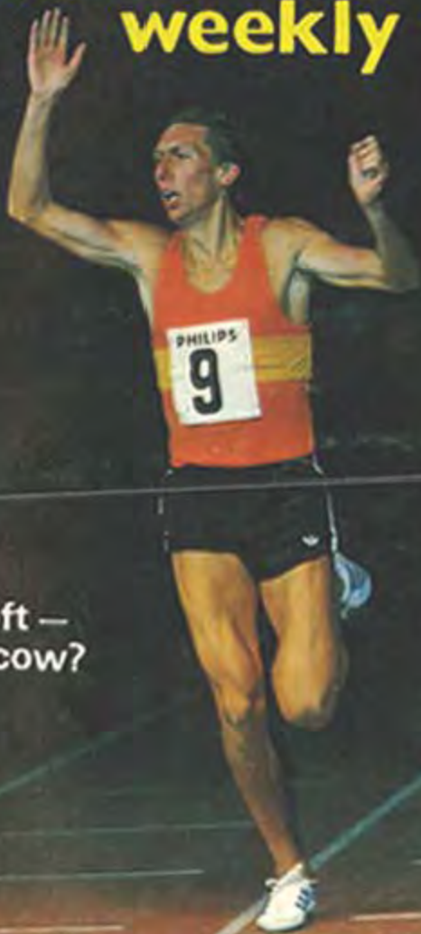
Dave Moorcroft — 5000m In Moscow?