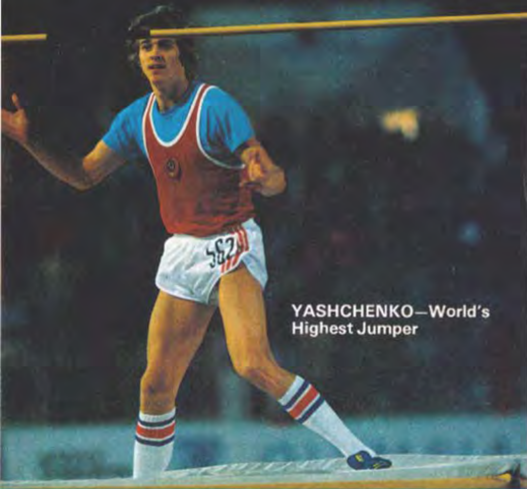
YASHCHENKO —World's Highest Jumper