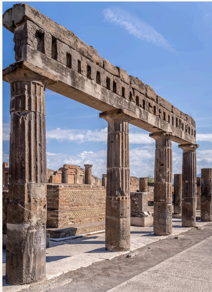
Ruins at Pompeii

Next2 uses delicious local ingredients in a sleek, modern setting with a terrific wine list. Known more for scene than cuisine, channel your inner Italian celebrity at Chez Black . No trip to Positano is complete without a meal on the terrace at La Sponda , located at Le Sireneuse Hotel. It’s fancy, it’s expensive, its beyond picturesque, and it’s perfect.