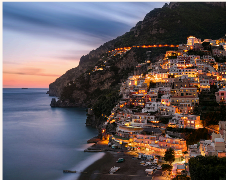
Positano at Dusk

You can't go wrong with Da Gemma , which offers divinely prepared seafood that is best enjoyed on their terrace. Also not to be missed is Sensi , for yet another perfectly designed restaurant with exquisite food, sea views, and a Michelin star.