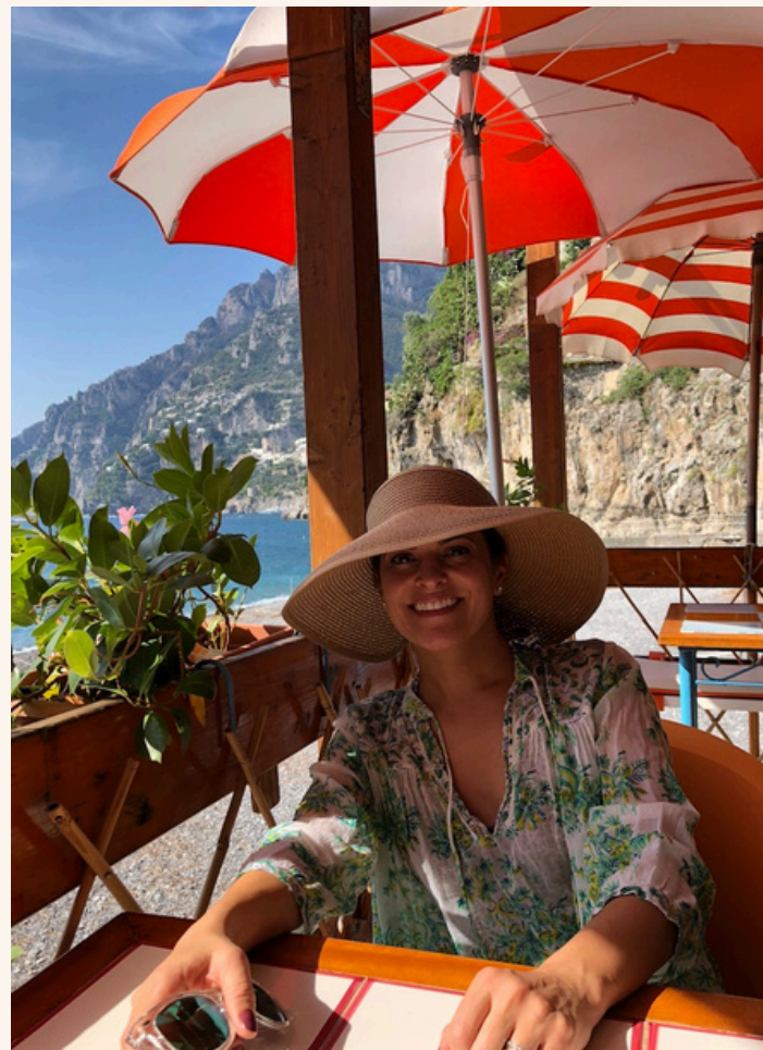
Arienzo Beach Club