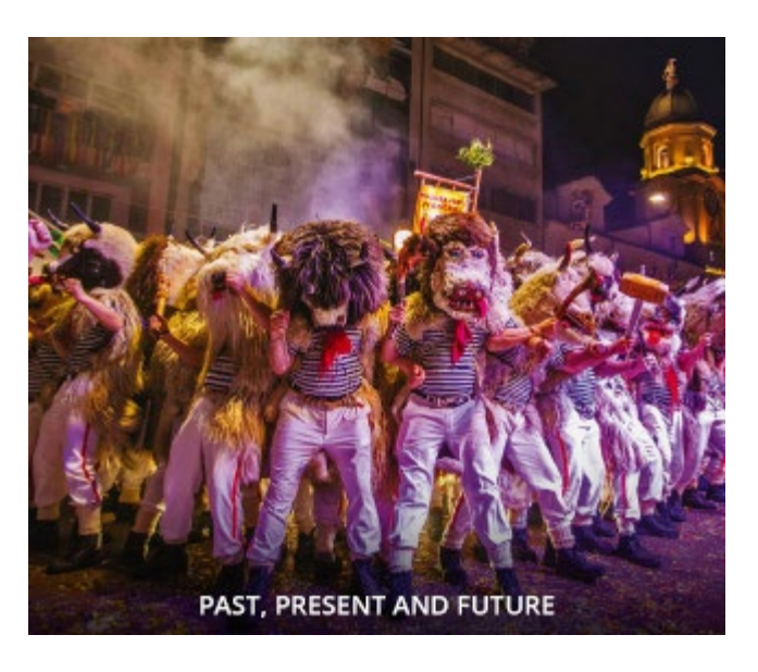
European Capitals of Culture