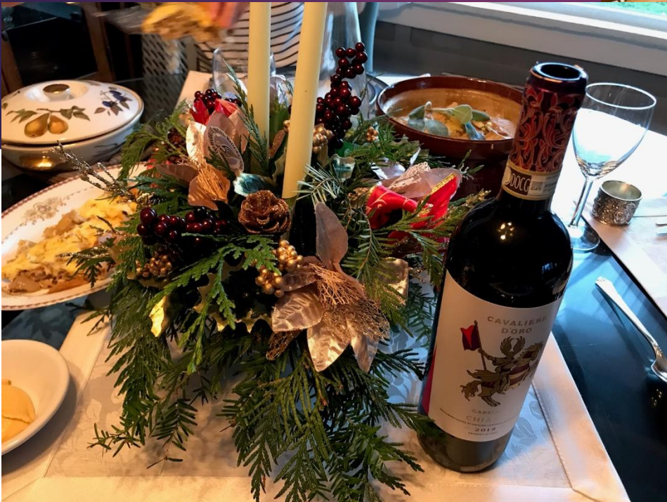
Bouquets for the holiday party