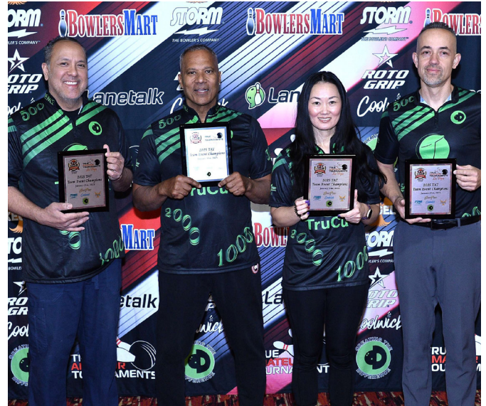
TAT Team Challenge Champions from Las Vegas, NV took home $10,000

Let Orleans Business Center ship your equipment home from the bowling center concourse!