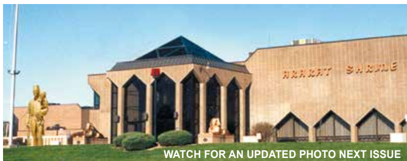
WATCH FOR AN UPDATED PHOTO NEXT ISSUE