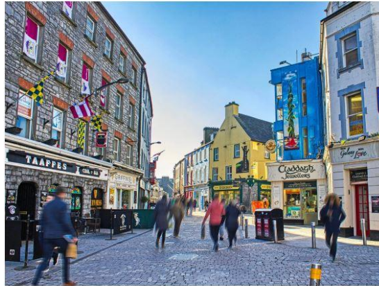
Shop Street, Galway City.