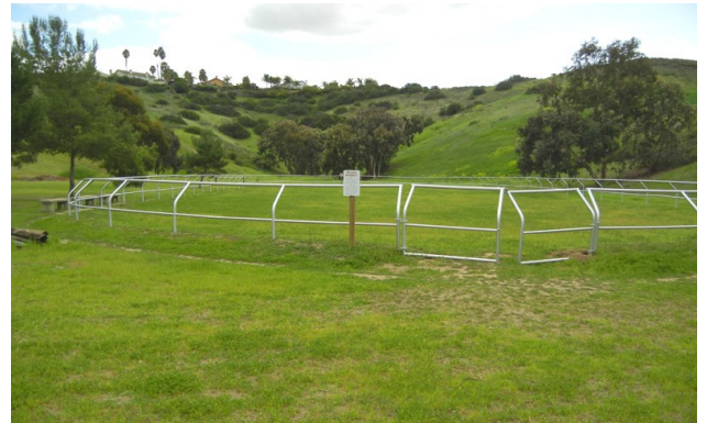
A place to retire.

A Dedicated Volunteer Board & Semi-Volunteer Staff