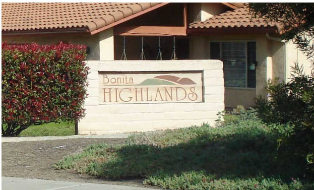
A place to raise a family.