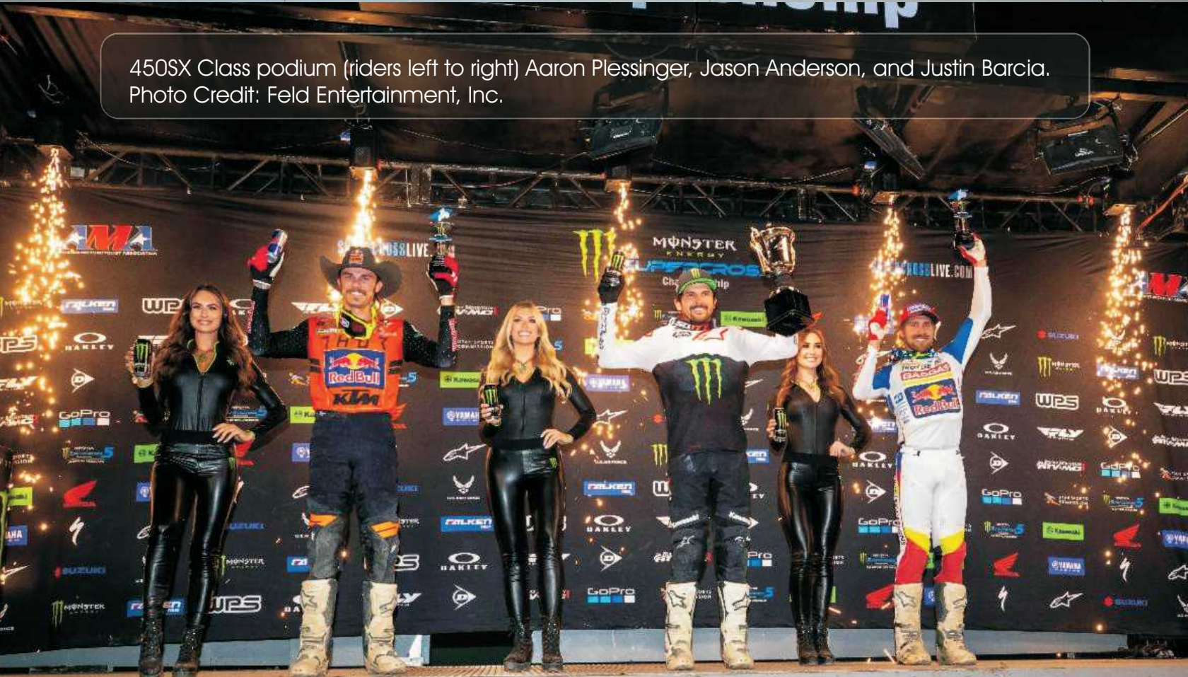
450SX Class podium (riders left to right) Aaron Plessinger, Jason Anderson, and Justin Barcia.