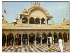
RADHA RANI TEMPLE 20 MINT. DRIVE