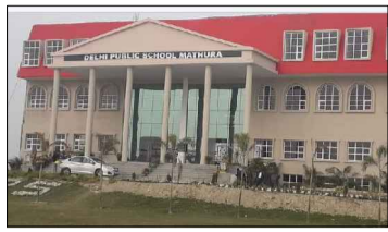
DELHI PUBLIC SCHOOL MATHURA 15.0 MINT DRIVE