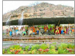
GIRRAJ JI TEMPLE 25 MINT. DRIVE