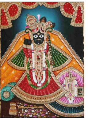
BIHARI JI TEMPLE 35 MINT. DRIVE