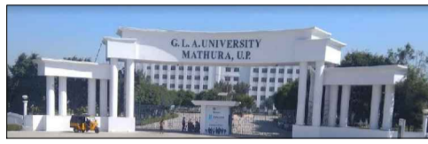
GLA UNIVERSITY 20.0 MINT DRIVE