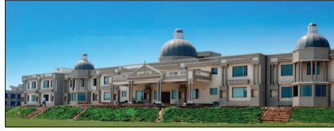
SANSKRITI UNIVERSITY 10.0 MINT DRIVE