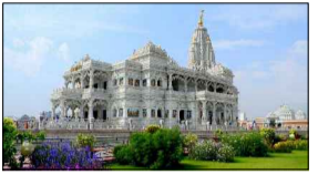
PREM MANDIR 30 MINT. DRIVE