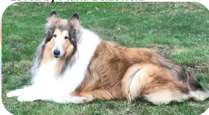
Earthstar's Tangled at LegendHold PT, RA - "Rapunzel" 03/07/2013 - 01/27/2026