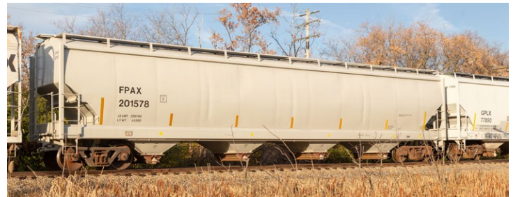
This is an older 6221 model, seen in a group of pellet hoppers.