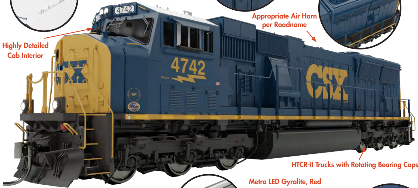
HTCR-II Trucks with Rotating Bearing Caps