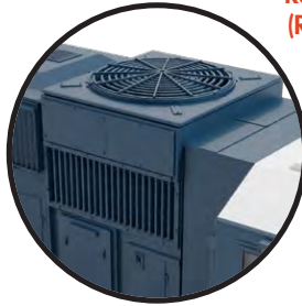
Raised Dynamic Brake Section (Rebuilt SD70MACe/SD70AC)