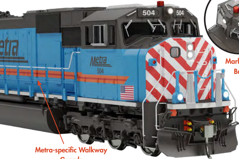
Metra-specific Walkway Guards