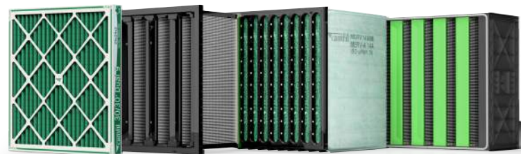
30/30 ® Dual 9 Durafil ® ES 2 Hi-Flo ® ES Absolute ® VG

Prefilter: 30/30 Dual 9, Hi-Flo ES or Durafil ES 2 Followed by: Absolute VG ® , Filtra 2000 ® or XH Absolute ®