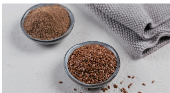
Organic ground linseed