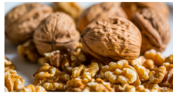
Organic Raw Walnuts