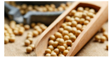
Organic Non-GMO Soy Beans/Edamame