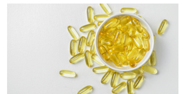
Fish Oil Supplements*

*Speak with your professional health practitioner about the appropriate dosage & brand specific for your individual needs.