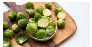
Brussel Sprouts 1 cup (90 g) = 3 g protein