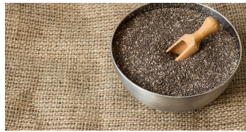
Organic Chia Seeds