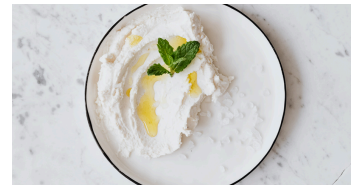
Low Fat Cottage Cheese 1 cup (226 g) = 28 g protein