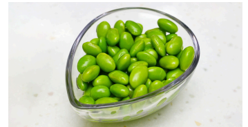
Edamame 1 cup (120 g) = 12 g protein