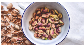
Pistachio 1/4 cup (30 g) = 6 g protein