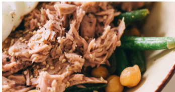
Cooked Tuna 3 oz (85 g) = 22 g protein