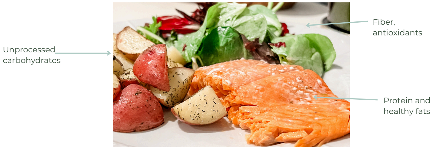
Example of a Balance Plate

To improve insulin sensitivity, meals should be balanced with clean protein, healthy fats, and fibre. Healthy fibre is abundant in whole foods such as vegetables, fruit, beans, legumes, and minimally processed grains (such as quinoa or barley).