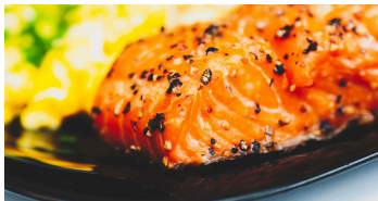
Cooked Salmon 3 oz (85 g) = 22 g protein