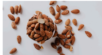
Almonds 1/4 cup (36 g) = 8 g protein