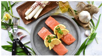
Wild Caught Salmon

Here are some examples of quality omega-3 sources: