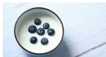
Low Fat Greek Yogurt 1 cup (240 g) = 28 g protein