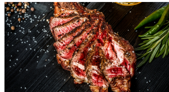
Lean Cooked Steak 3 oz (85 g) = 26 g protein