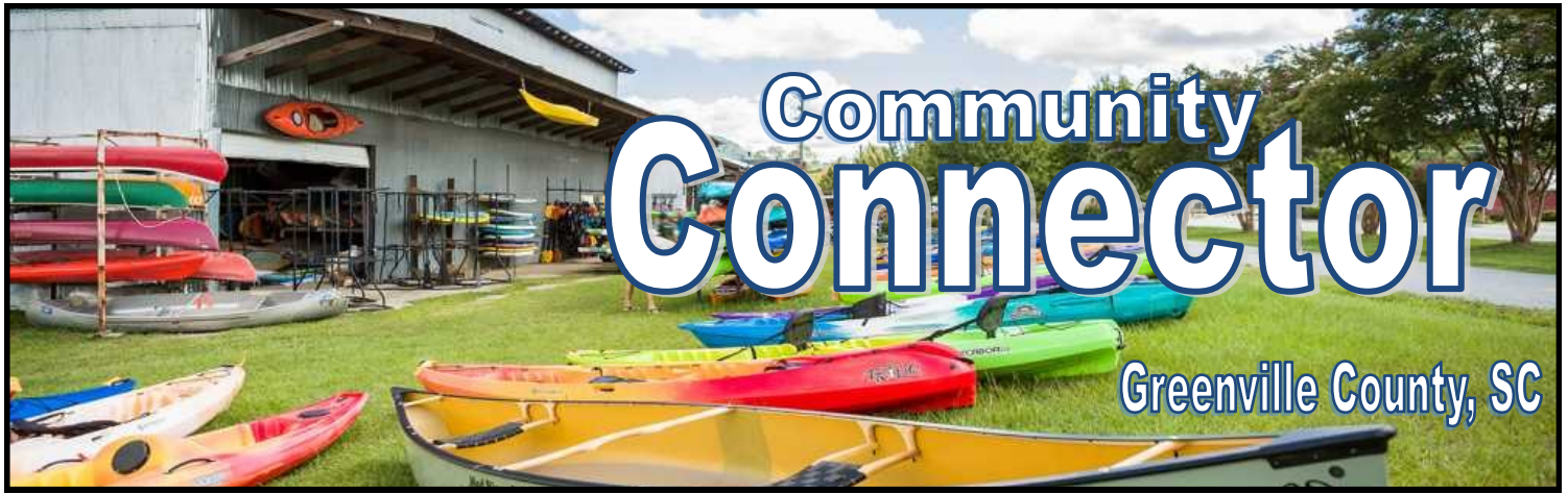
Sunrift Adventures, Travelers Rest, SC