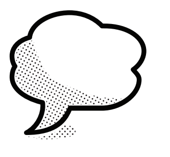
Take it one day at a time and do your best

Now that I'm almost 18, I'm finally comfortable talking to my friends and family about this terrible disease. I've found that no two people with IBD have the same symptoms or can eat the same food. You can eat something one day