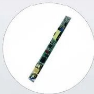
Explosion Proof Driver