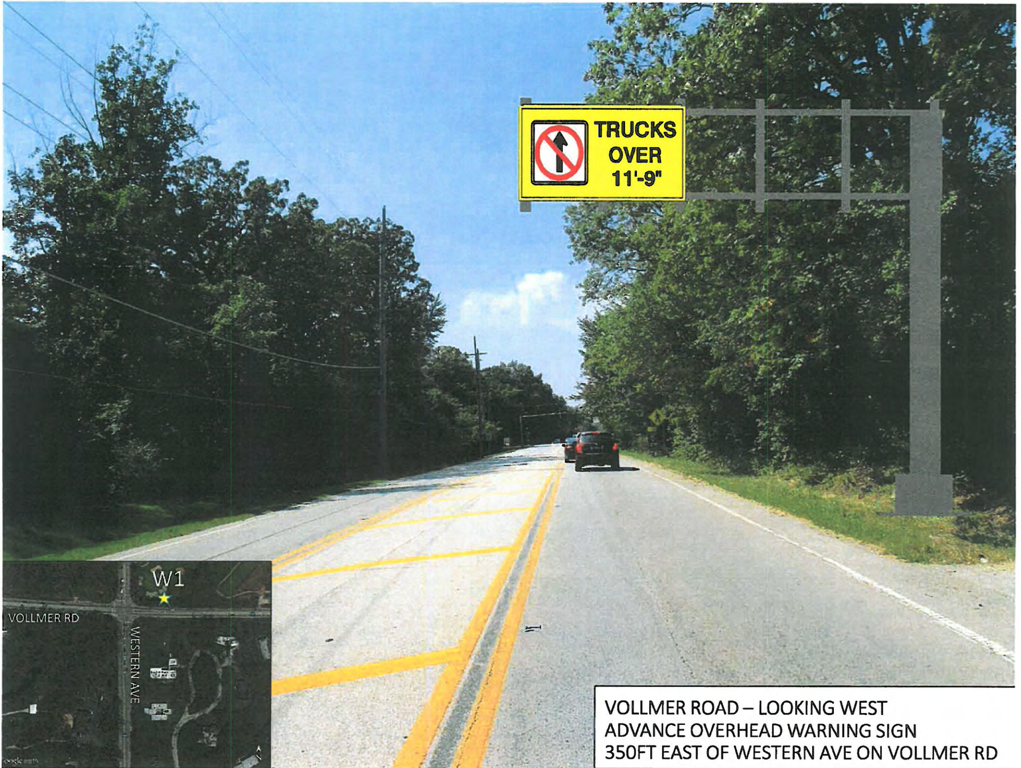
VOLLMER ROAD – LOOKING WEST ADVANCE OVERHEAD WARNING SIGN 350FT EAST OF WESTERN AVE ON VOLLMER RD