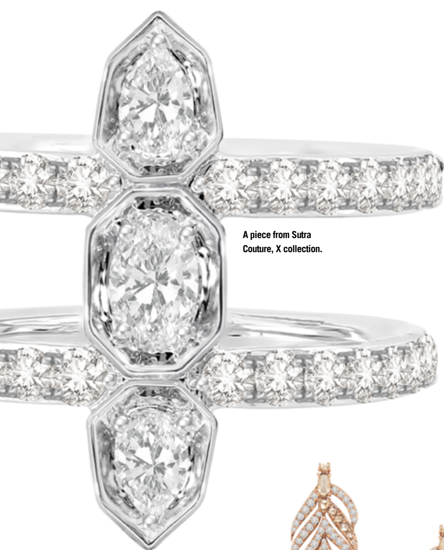
A piece from Sutra Couture, X collection.