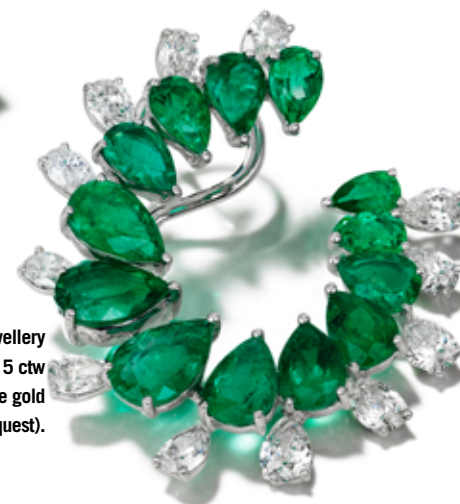
Earrings from Sutra High Jewellery Collection, 16 ctw emerald, 5 ctw black pearl, 18K white gold (price upon request).