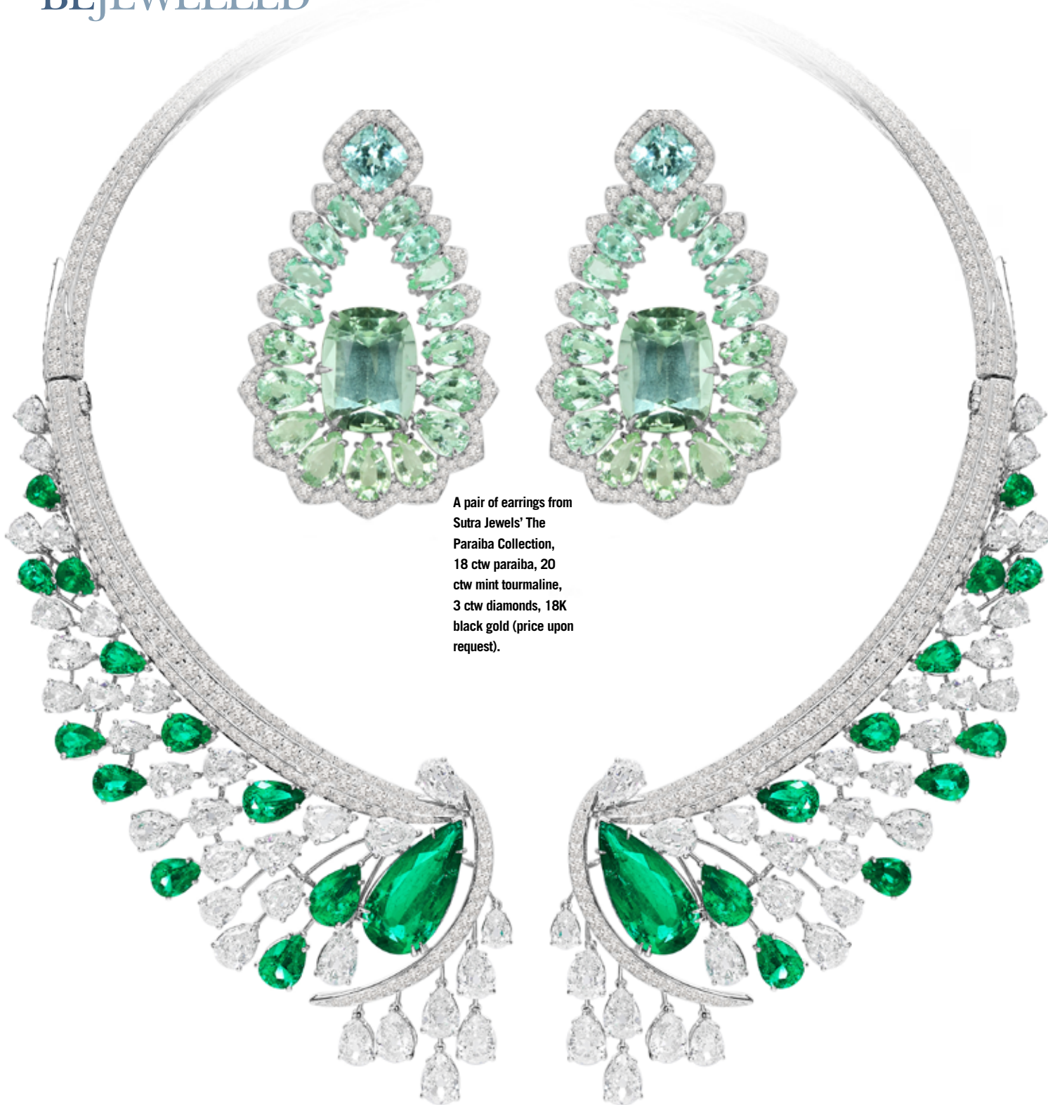
A pair of earrings from Sutra Jewels' The Paraiba Collection, 18 ctw paraiba, 20 ctw mint tourmaline, 3 ctw diamonds, 18K black gold (price upon request).