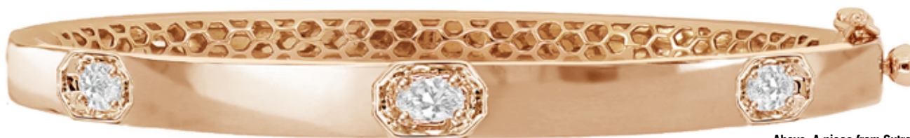
Above: A piece from Sutra Couture, X collection. Below: A piece in sapphire and diamond from the Scintillae Collection of Sutra Jewels that made its debut at The Couture Show in Las Vegas, Nevada, in May last year.