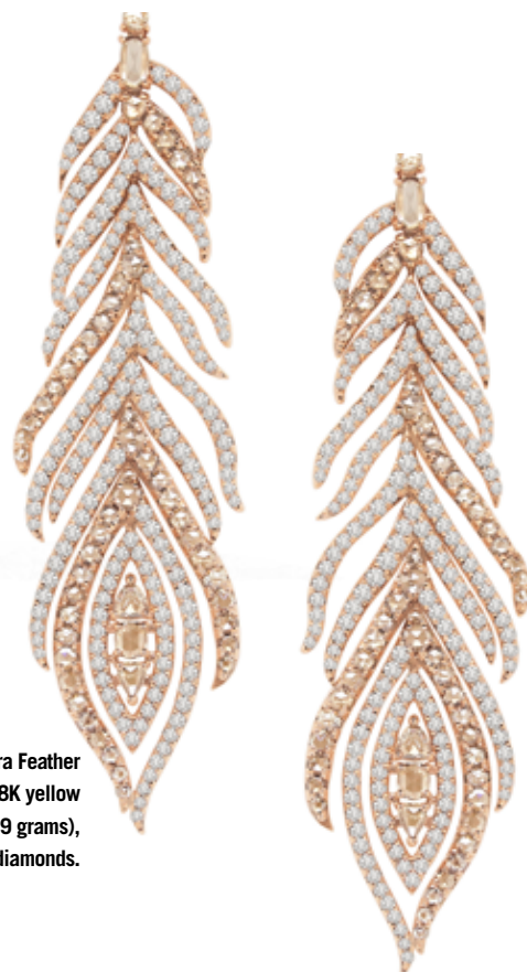
Earrings, Sutra Feather Collection, 18K yellow gold (16.59 grams), 7.8cts diamonds.