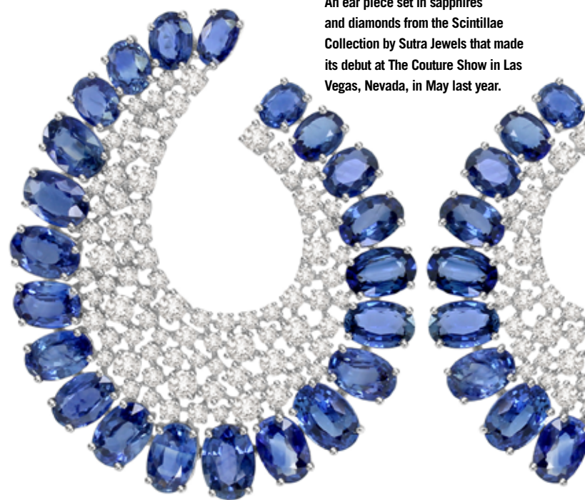
An ear piece set in sapphires and diamonds from the Scintillae Collection by Sutra Jewels that made its debut at The Couture Show in Las Vegas, Nevada, in May last year.

My family manufactured traditional Western jewelry, and my husband's family manufactured traditional Indian