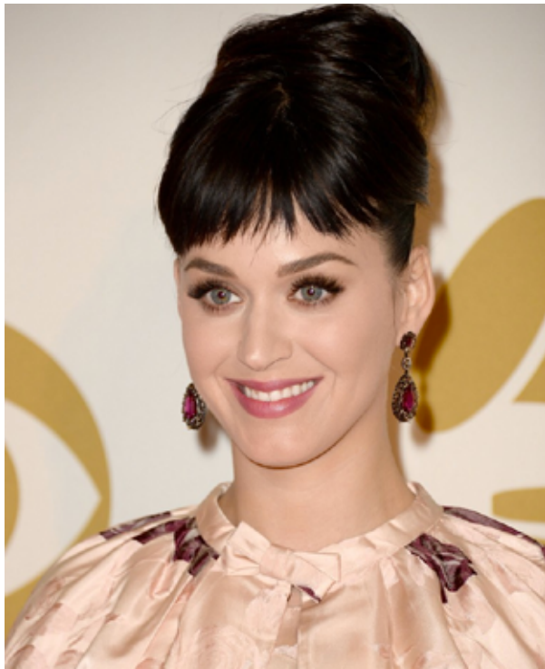
Celebrities sporting Sutra Jewels on various occasions, clockwise from top left: Former First Lady of the US, Michelle Obama, Amanda Righetti, Chrissy Teigen (at the Donna Karan Show), Kim Kardashian, Priyanka Chopra, Shakira, Mila Kunis, Jennifer Lopez (at the MET Gala 2015, and Katy Perry (at the Beatles Tribute Grammys Weekend 2014).