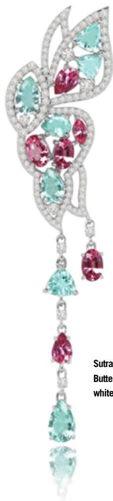
Sutra Jewels, earrings, Butterfly Collection, 18k white gold.