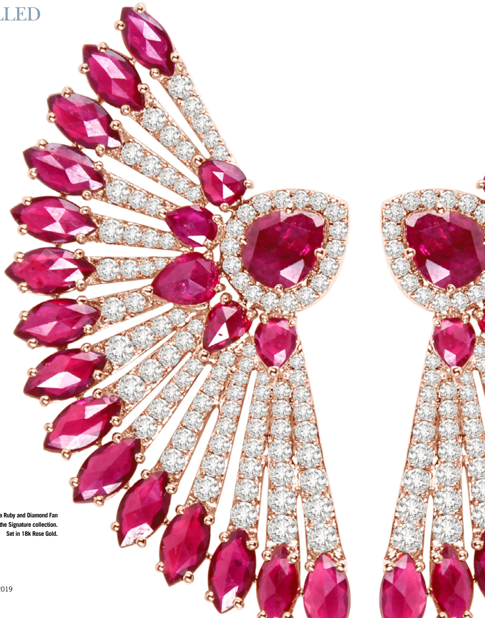
The Sutra Ruby and Diamond Fan Earrings from the Signature collection. Set in 18k Rose Gold.