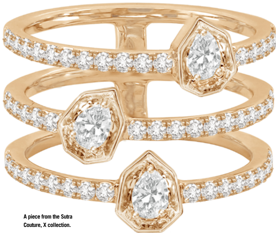
A piece from the Sutra Couture, X collection.

Sutra Jewels has turned 10. How have these 10 years been for you as the owner of a brand that is already sought-after? Has your brand's trajectory progressed in a manner you would have dreamed?