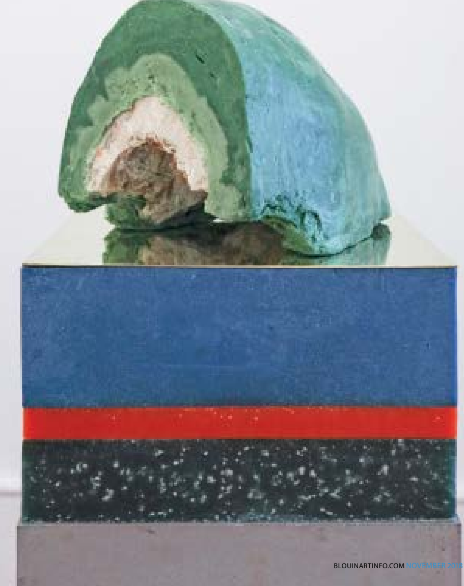
RIGHT: Bharti Kher, "The Chimera (1)," 2016, wax, concrete, plaster, hessian fibre, brass, 49 × 11 3/8 × 11 3/8 in.