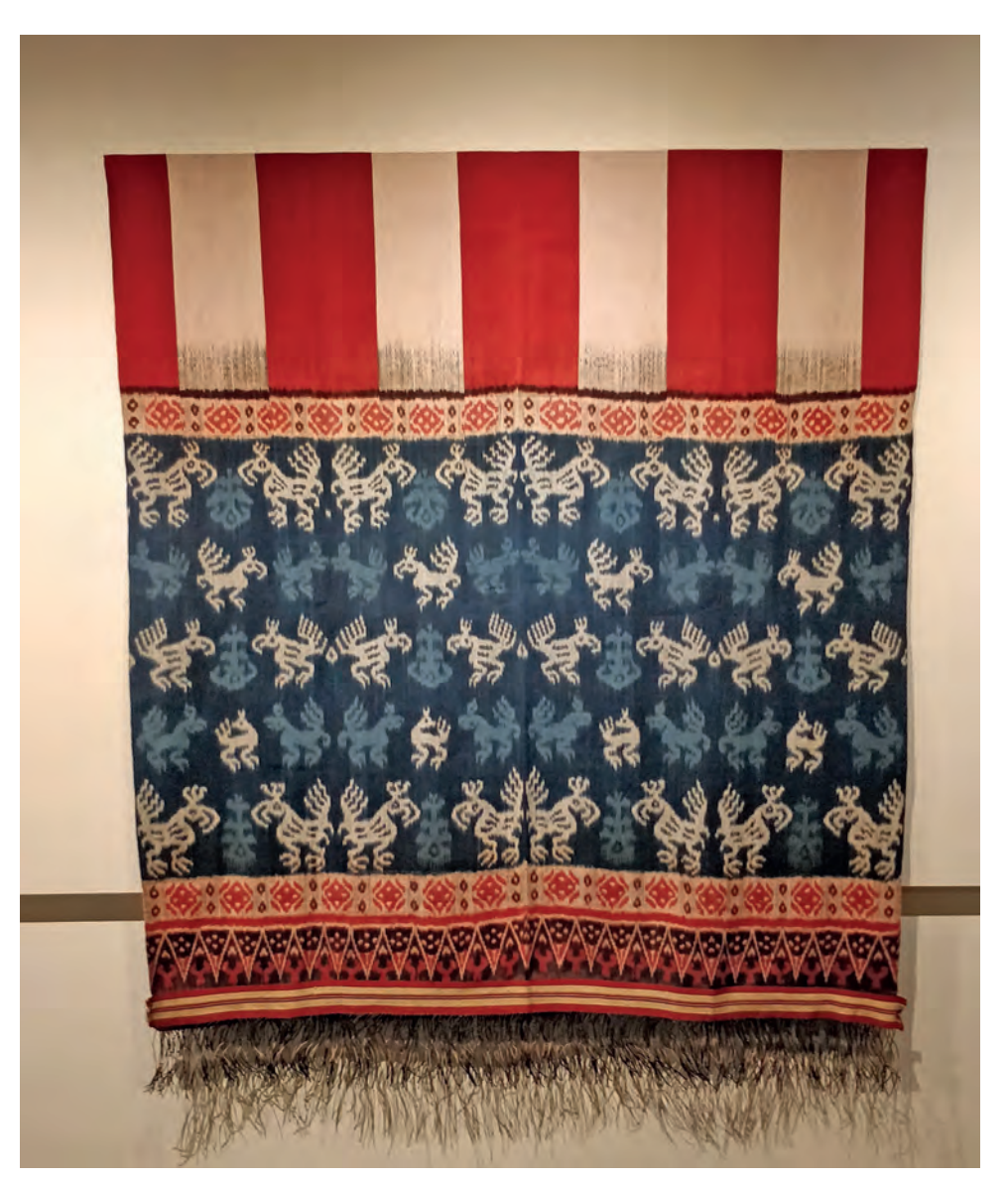
An indigo-dyed textile on view at the museum.

"Being a natural dye, it's almost a living being and reacts accordingly. For instance, it doesn't fade in the sun..."