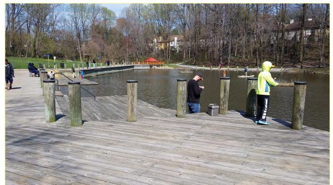
Replacement of the Lake Elkhorn Boardwalk, or "Boat Dock," is an Owen Project listed in the CA draft Capital Budget for FY26.