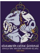
Elizabeth Celtic Festival