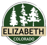
Town of Elizabeth