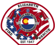
Elizabeth Fire Protection District