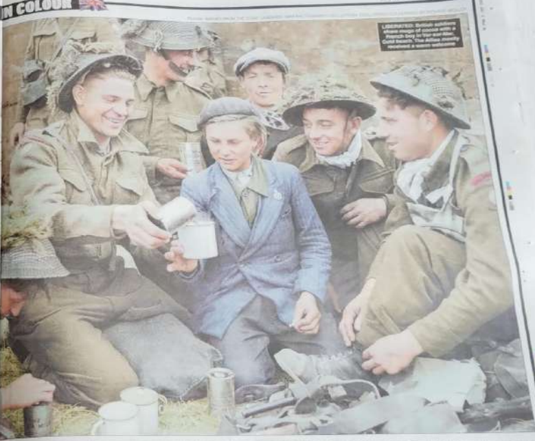
LIBERATED: British soldiers free German POWs from a camp in the Netherlands. The city was the D-Day target