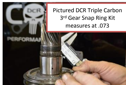
Pictured DCR Triple Carbon 3 rd Gear Snap Ring Kit measures at .073