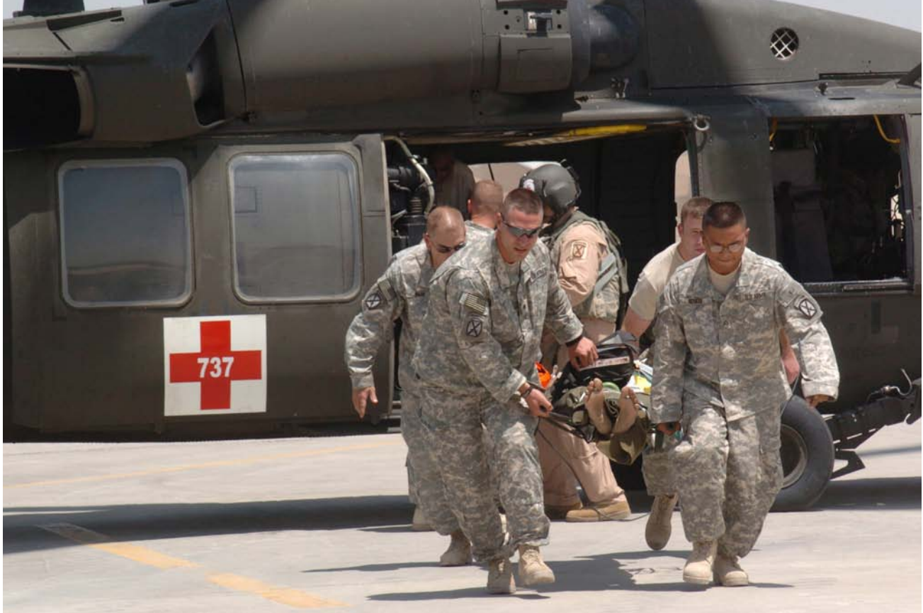
Programs such as Biological Control, Biostasis, BRICS, ElectRx, HAPTIX, and Neural Engineering System Design lay the foundations for powerful new capabilities to preserve troop health, facilitate recovery, and restore function.

data-sharing, and publication of results, and initiates critical discussions concerning the ethical, legal, and social implications (ELSI) of active and proposed research.