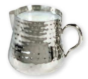
Banquet Creamer w/o lid 8 oz. CLACREAM 3"D x 3"H - 0.5#