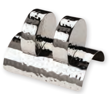
Disc Salt/Pepper Set w/tray HDSP 3"D x 4.5"H - 0.75# t Replacement Stoppers STOPSM,