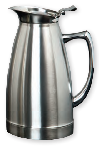
0.7 Liter / 22 oz. CWP700 4"D x 8"H - 1.7#