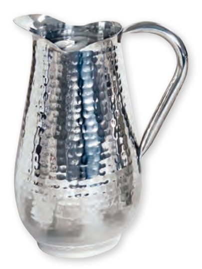
"Dolphin" Water Pitcher w/o guard 85 oz. CHM025