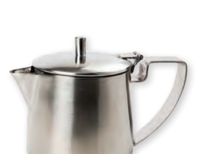
Teapot w/hinged lid 12 oz. NWVTP12 3.5"D x 4.5"H - 0.75#