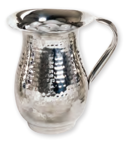
Footed Bell Pitcher w/o guard 68 oz.