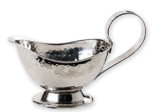
Gooseneck Sauce Boat 9 oz. CHASBT9 7.5"L x 3.5"W x 5"H - 0.6#.