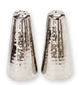
Conical Salt/Pepper Set CHASP9 1.25"D x 3.75"H - 0.3#