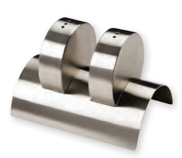
Disc Salt/Pepper Set w/tray NWVDSP 3"D x 4.5"H - 0.75#