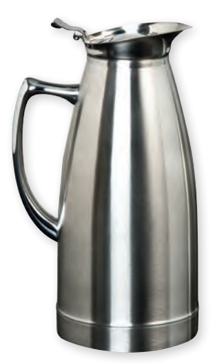
1.0 Liter / 34 oz. CWP1000 4"D x 9"H - 1.8#