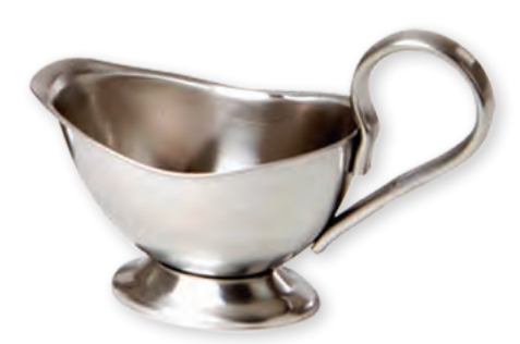
Gooseneck Sauce Boat 9 oz. ESB260B 7.5"L x 3.5"W x 5"H - 0.6#