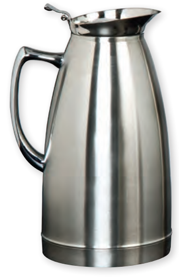
1.5 Liter / 51 oz. CWP1500 5"D x 10"H - 2.2#