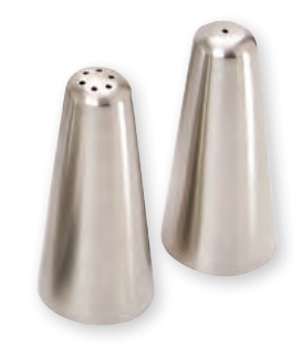
Conical Salt/Pepper Set ESP9B 1.25"D x 3.75"H - 0.3#