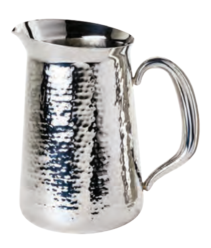
Water Pitcher w/o guard 68 oz. HWP200 5.25"D x 8"H - 1.5#