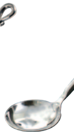
CAL419 10" Salad Dressing Ladle 1oz.