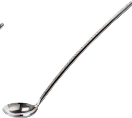
CHA419 - 10" Salad Dressing Ladle 1oz.