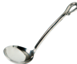
CAL420 6" Sauce Ladle