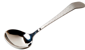
CHA420 6" Sauce Ladle