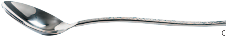
CHA411 - 13" Solid Spoon