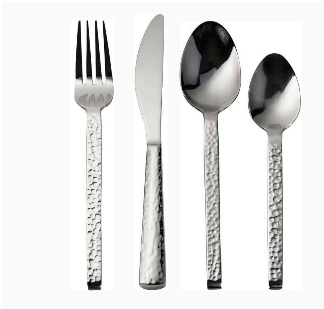
MCH221 Dinner Fork 8"