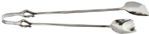
CAL415 - 12" Serving Tongs