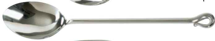
CAL411 - 13" Solid Spoon