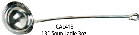
CAL413 13" Soup Ladle 3oz