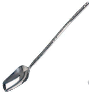
CHA416 - 8" Salad Topping Spoon