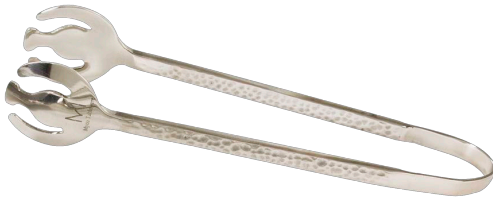
CHA405 9" Round Head Tongs