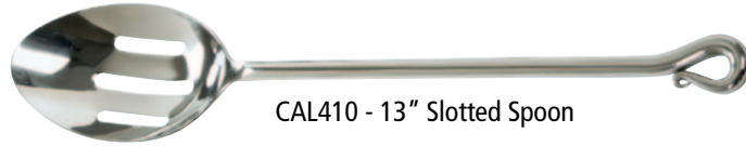
CAL410 - 13" Slotted Spoon