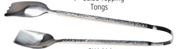
CHA414 9.5" Salad Tongs