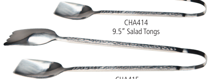
CHA415 12" Serving Tongs