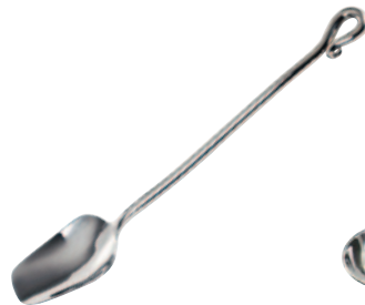
CAL416 8" Salad Topping Spoon