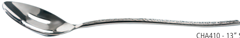
CHA410 - 13" Slotted Spoon