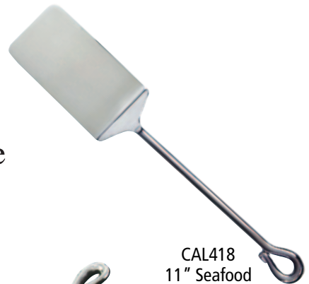
CAL418 11" Seafood Spatula