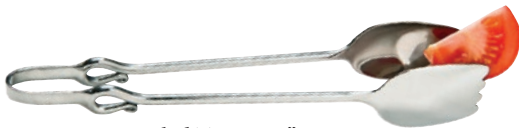
CAL414 Salad Tongs 9.5"