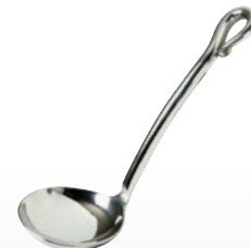
CAL420 Sauce Ladle 6"