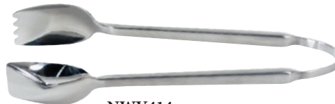
NWV414 Brushed Salad Tongs 9.5"