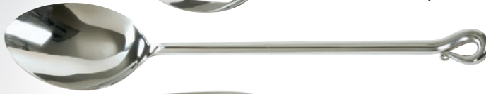
CAL411 Solid Spoon 13"