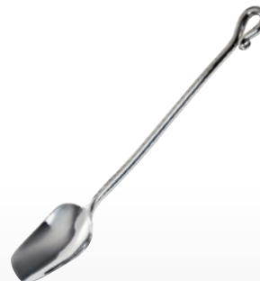
CAL416 Salad Topping Spoon 8"