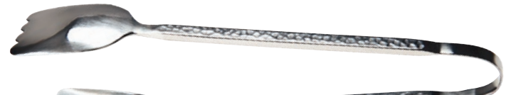
CHA415 Serving Tongs 12"