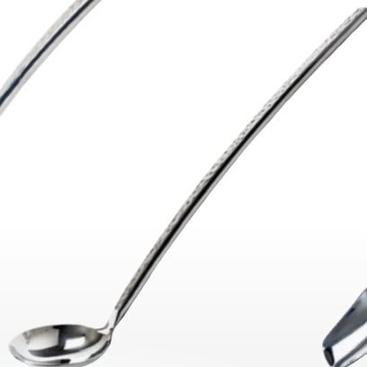
CHA419 Salad Dressing Ladle 1oz.- 10"