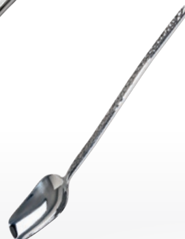
CHA416 Salad Topping Spoon 8"