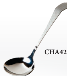
CHA420 Sauce Ladle 6"