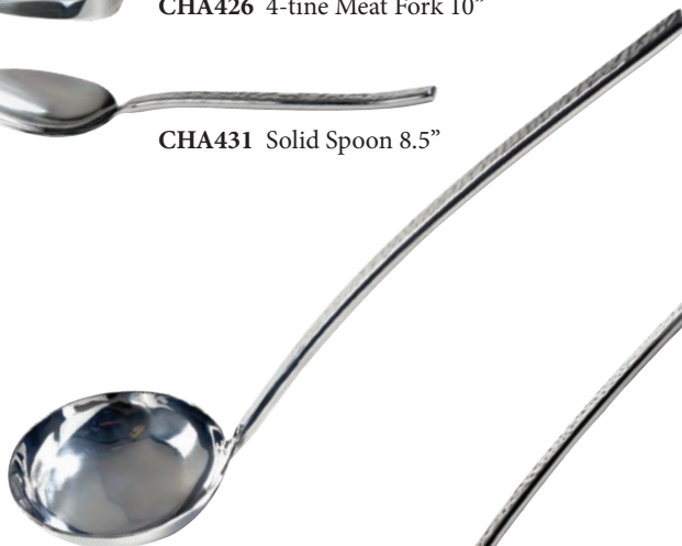
CHA413 Soup Ladle 3oz. - 13"