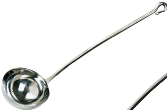
CAL413 Soup Ladle 3oz. - 13"