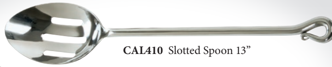
CAL410 Slotted Spoon 13"