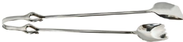
CAL415 Serving Tongs 12"