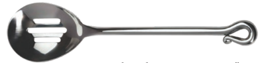
CAL424 Slotted Serving Spoon 10"