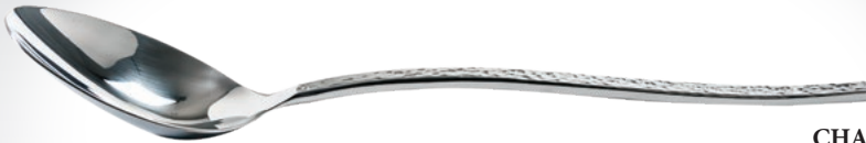
CHA411 Solid Spoon 13"