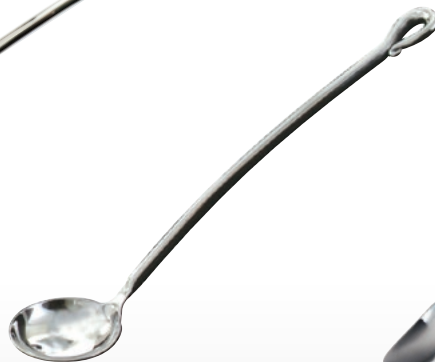
CAL419 Salad Dressing Ladle 1oz. - 10"