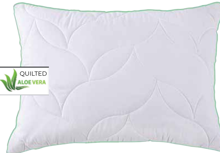
Comfort BS 5335