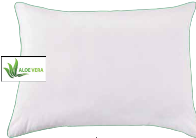
Comfort BS 5335