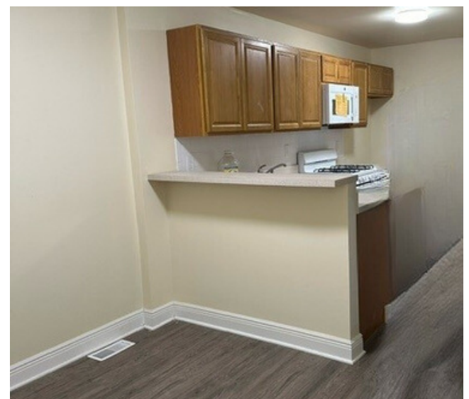
Pictured Above: Renovated eat-in kitchen of 703 Bennett Street in Wilmington, DE.