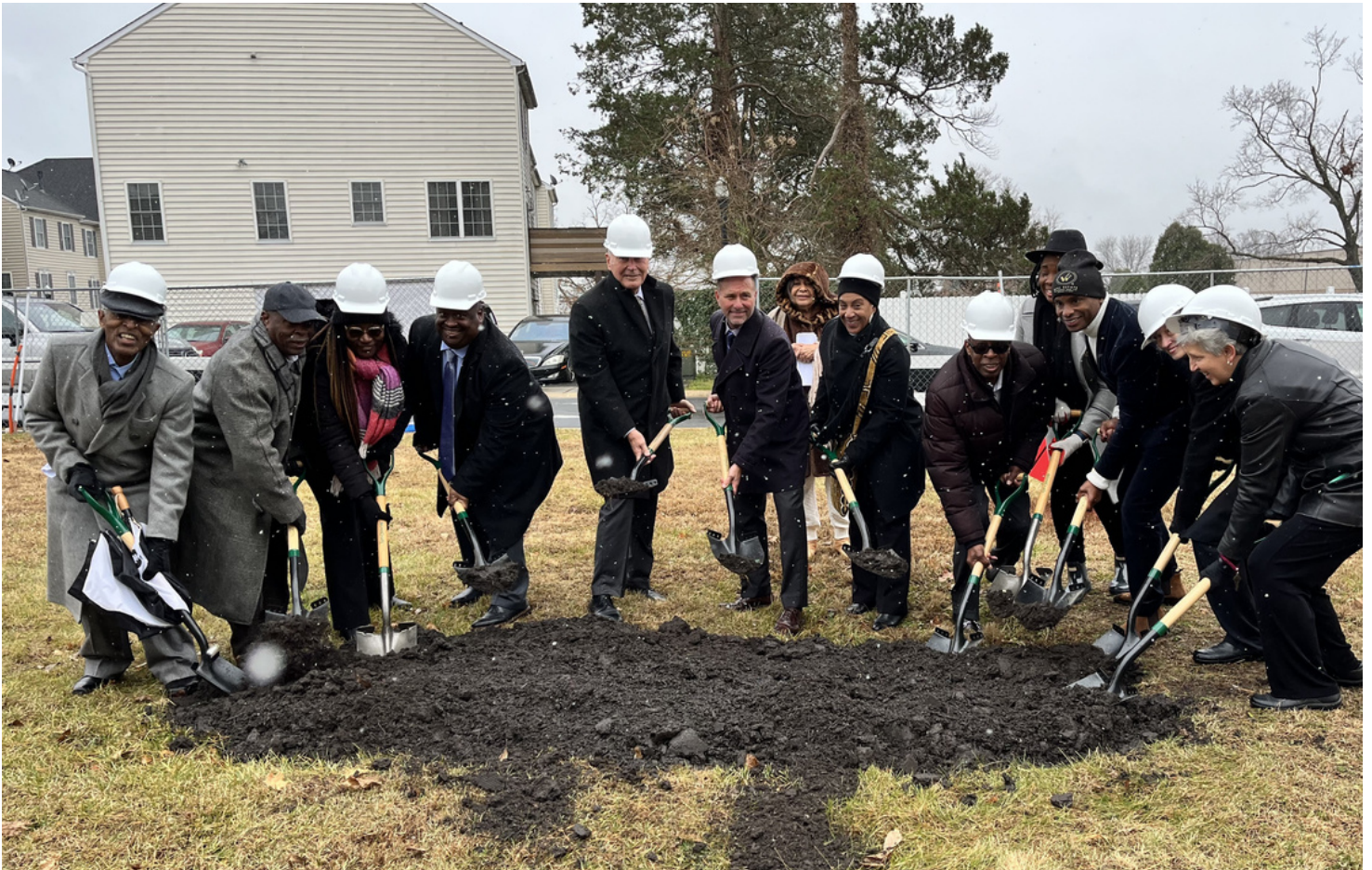
Pictured Above: Ceremonial Shovel Toss at McMullen Square Groundbreaking.

DAHG anticipates completion of this project in 2024. For more details on purchasing one of the McMullen Square townhomes, contact Jacinta Puckett at jpuckett@dahg.org or call 302-445-6531.