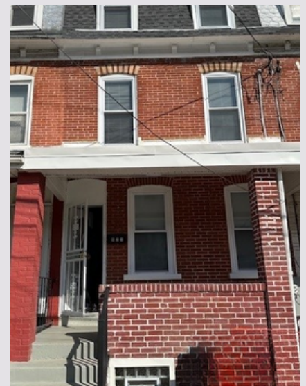
Pictured Above: 931 Vandevere Avenue.