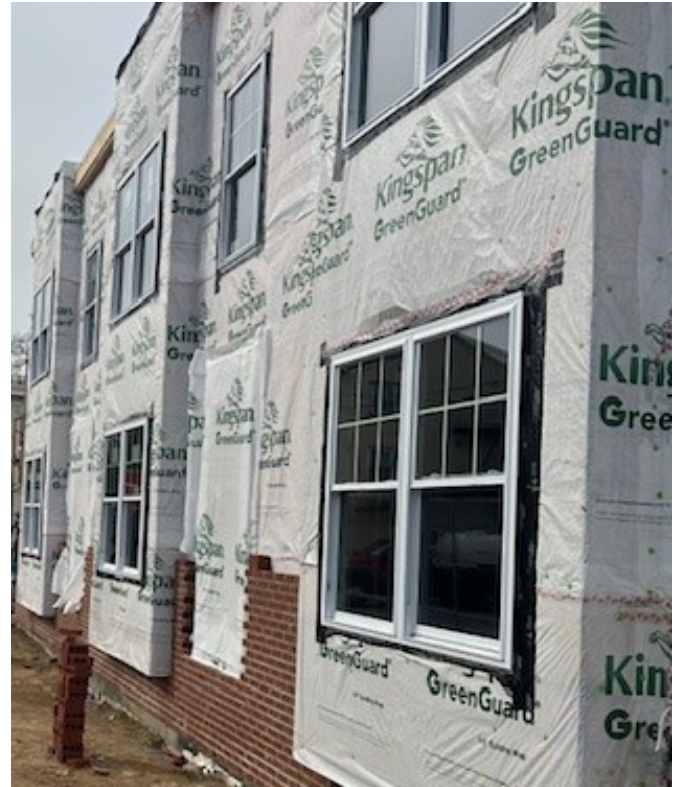
Pictured Above: Frontage at 801 to 809 Bennett Street in Wilmington.