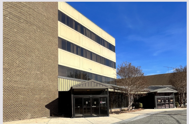
Pictured Above: 321 E. 11th Street in Wilmington, DE.

For more information, email info@dahg.org .